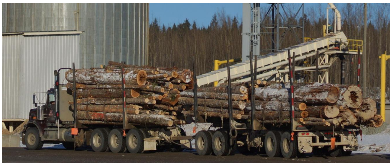
Figure 3. Old growth cedar logs arriving at the Pacific Bioenergy pellet plant in Prince George, British Columbia.

Additionally, there is nothing in the RED that protects any particular forest from being harvested, even the most carbon rich and biodiverse, and there is no prohibition on the most damaging forestry practices. This means we will continue to see egregious forest exploitation by the biomass and wood pellet industry including logging in wetland hardwood forests of the US Southeast, 8 clearcutting of boreal forests in Estonia, 9 illegal logging in Romania’s Carpathian Mountains to make pellets for residential heating, 10 and recently, logging old-growth in British Columbia’s inland rainforest 11 (Figure 2). The RED’s “sustainability” criteria do not require even minimum protections, let alone mandating sustainable forestry practices like retaining forestry residues to protect soil nutrient status, which a major survey identified as at risk from biomass harvesting. 12